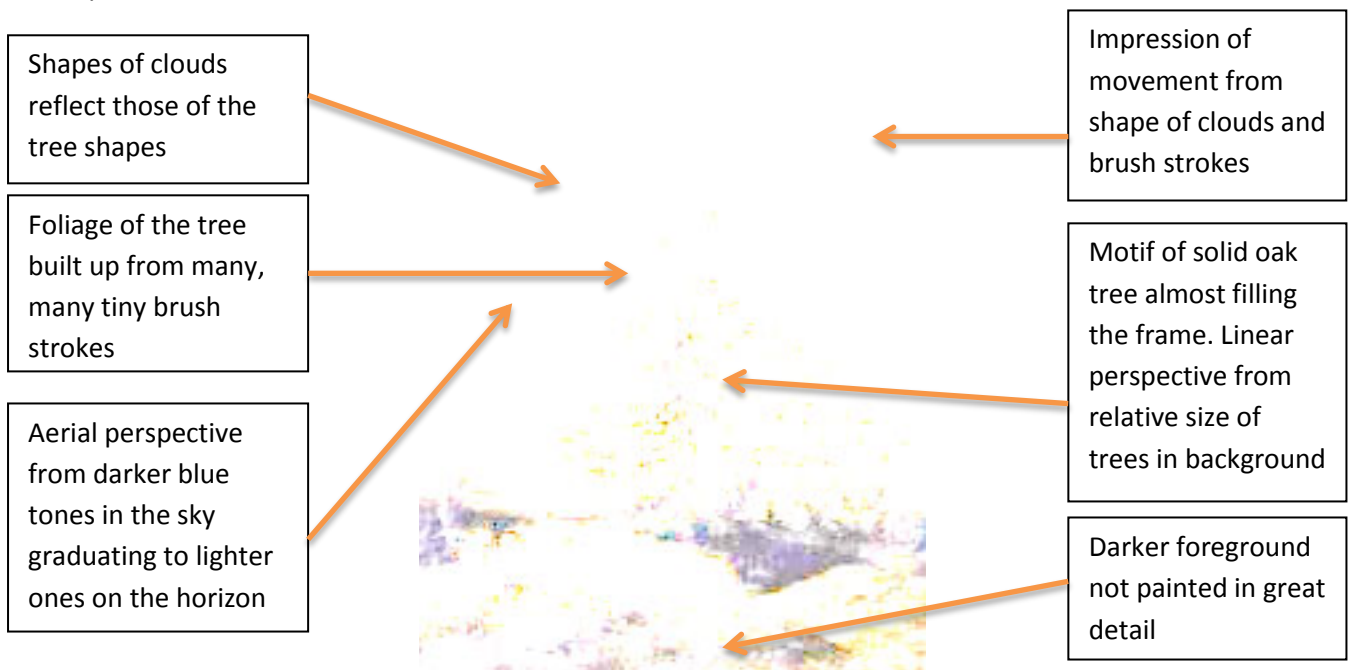
oil on canvas, 1251 x 1003mm, Tate Gallery, London

The massive oak tree is a motif for the strength and grandeur of nature and the light which bathes the whole scene is captivating. The children are not painted in great detail, tending more towards an impressionistic effect, which draws attention back to the oak.