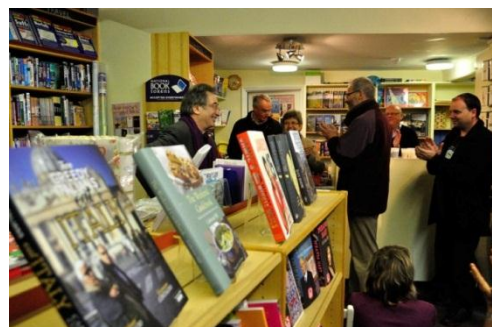
7 (Right) Applause at the end of the reading.