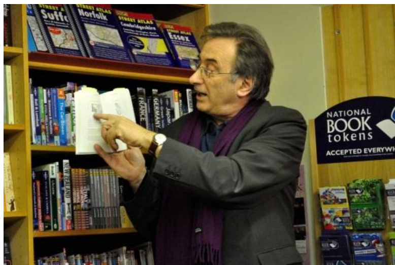
6 (Left) Pointing out the illustrations in the book (done by his daughter).