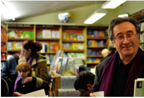
4 (Left) The author welcoming guests to the launch.